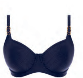
FS6901 UW BALCONY BIKINI TOP

UK 32-40 D-G 32-38 GG 32-36 H EU 70-90 D-I 70-85 J 70-80 K