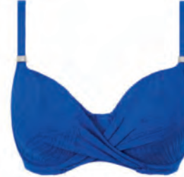
FS6355 UW WRAP FRONT FULL CUP BIKINI TOP