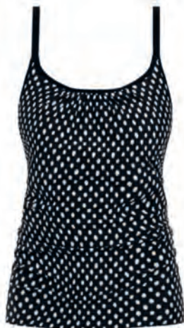
FS6724 UW SCOOP NECK TANKINI