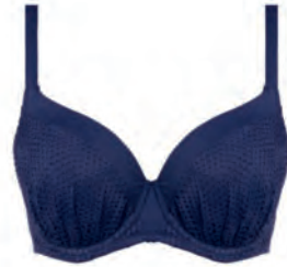
FS6681 UW MOULDED GATHERED BIKINI TOP

UK 30-40 D-GG 32-38 H EU 65-90 D-J 70-85 K