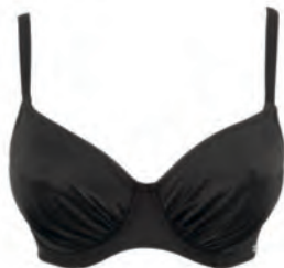
FS5749 UW GATHERED FULL CUP BIKINI TOP

UK 30-40 D-GG 30-38 H EU 65-90 D-J 65-85 K