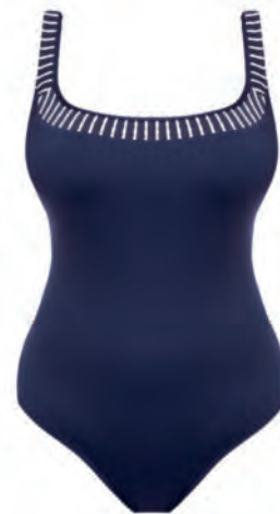
FS6508 UW SCOOP BACK SUIT