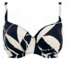
Île de Ré - Black & Cream