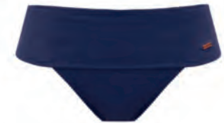
FS6695 CLASSIC FOLD BRIEF