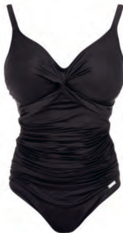
FS5754 UW TWIST FRONT SUIT – LIGHT CONTROL

UK 34-40 D 32-40 DD-GG EU 75-90 D 70-90 E-J