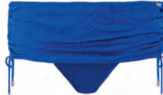
FS6359 ADJUSTABLE SKIRTED BRIEF