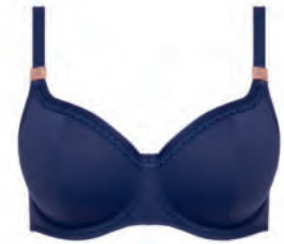
FS6690 UW LIGHTLY PADDED BALCONY BIKINI TOP

UK 32-40 D-G 32-38 GG 32-36 H EU 70-90 D-I 70-85 J 70-80 K