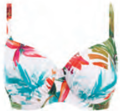
Kiawah Island - Aquamarine