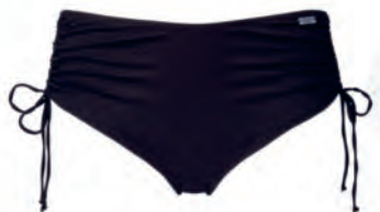
FS5756 SHORT - ADJUSTABLE LEG