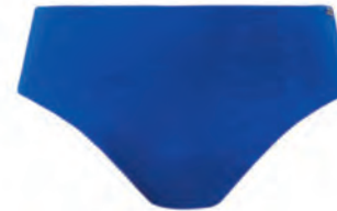
FS6361 MID RISE BRIEF