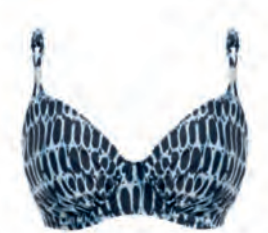
Kotu - Ink