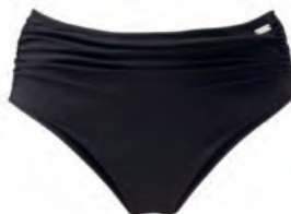
FS5752 DEEP GATHERED BRIEF - LIGHT CONTROL