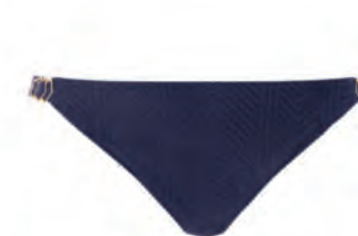
FS6905 BIKINI BRIEF