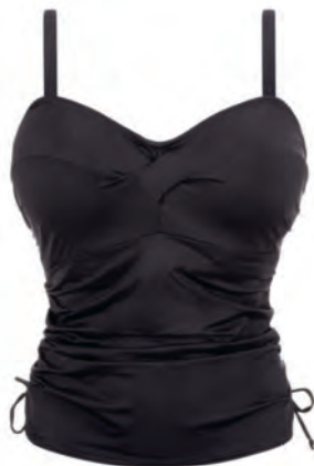
FS5751 UW TWIST FRONT TANKINI – LIGHT CONTROL