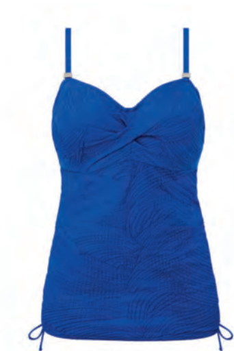
FS6356 UW TWIST FRONT TANKINI