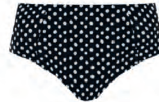
FS6727 HIGH RISE BRIEF