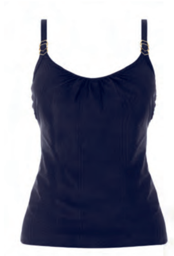
FS6904 UW SCOOP NECK TANKINI TOP