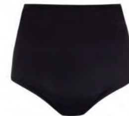
FS5772 HIGH WAIST BRIEF - LIGHT CONTROL