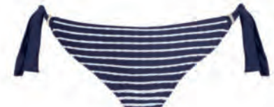
FS6505 CLASSIC TIE SIDE BRIEF