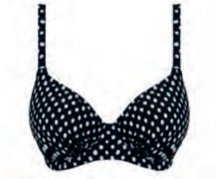
FS6720 UW GATHERED FULL CUP BIKINI TOP