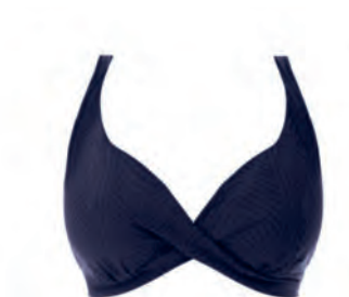
FS6900 UW PLUNGE BIKINI TOP