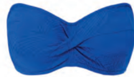
FS6354 UW TWIST BANDEAU - MULTIWAY STRAPS

UK 30-40 D-F 30-38 FF 30-36 G EU 65-90 D-G 65-85 H 65-80 I