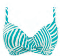
La Chiva - Aquamarine