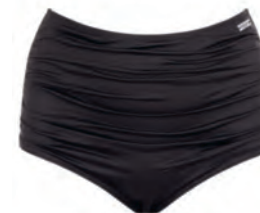
FS5753 GATHERED CONTROL SHORT