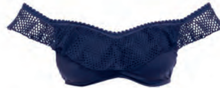
FS6682 UW BARDOT BIKINI TOP

UK 30-40 D-F 30-38 FF 30-36 G EU 65-90 D-G 65-85 H 65-80 I