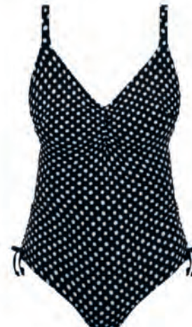
FS6729 UW V-NECK SUIT WITH ADJUSTABLE LEG

UK 32-40 D-GG 34-38 H EU 70-90 D-J 75-85 K