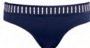
FS6506 MID RISE BRIEF