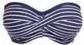
FS6504 UW TWIST BANDEAU - MULTIWAY STRAPS