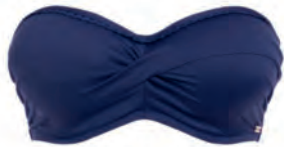
FS6691 UW TWIST BANDEAU - MULTIWAY STRAPS

UK 32-40 D-G 32-38 GG 32-36 H EU 70-90 D-I 70-85 J 70-80 K