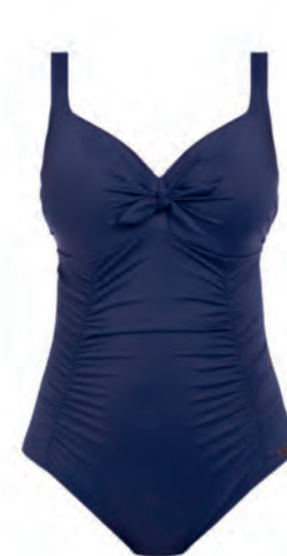
FS6699 UW MOULDED FULL CUP SUIT – LIGHT CONTROL

UK 32-40 D-F 32-38 FF-G EU 70-90 D-G 70-85 H-I