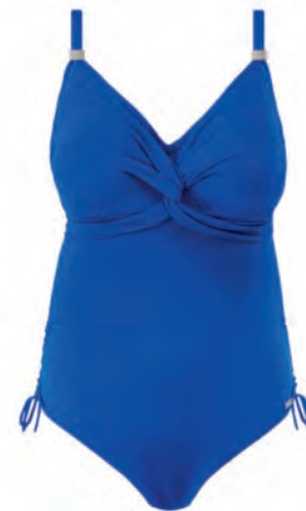
FS6360 UW TWIST FRONT SUIT WITH ADJUSTABLE LEG