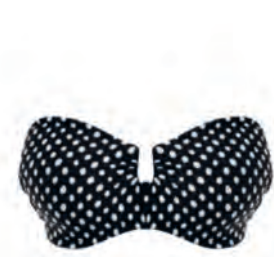
FS6723 UW BANDEAU - MULTIWAY STRAPS