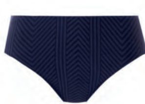
FS6906 MID RISE BIKINI BRIEF