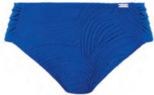
FS6358 MID RISE BRIEF - GATHERED SIDES