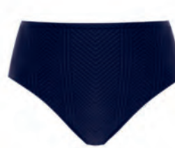
FS6907 HIGH WAIST BIKINI BRIEF