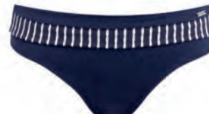
FS6507 CLASSIC FOLD BRIEF