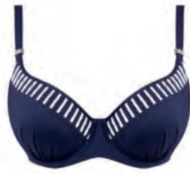
FS6500 UW MOULDED GATHERED BIKINI TOP

UK 30-40 D-GG 32-38 H EU 65-90 D-J 70-85 K