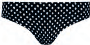
FS6725 MID RISE BRIEF