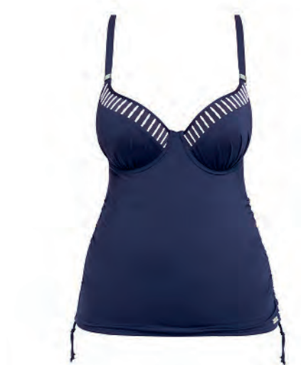
FS6501 UW MOULDED GATHERED TANKINI