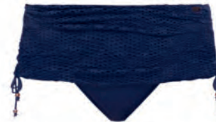
FS6686 ADJUSTABLE SKIRTED BRIEF