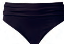
FS5757 CLASSIC FOLD BRIEF

UK 32-38 D-F 32-36 FF EU 70-85 D-G 70-80 H