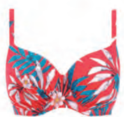
Santos Beach - Pomegranate