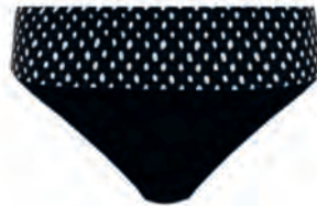
FS6726 CLASSIC FOLD BRIEF