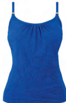
FS6362 UW SCOOP NECK TANKINI