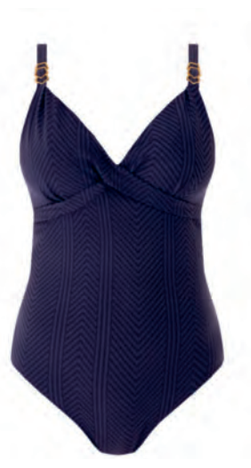
FS6908 UW PLUNGE SWIMSUIT