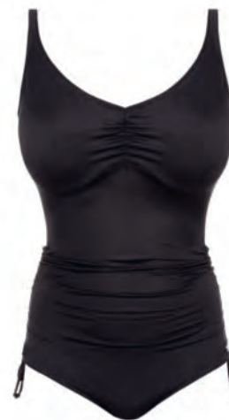
FS5755 UW V-NECK SUIT – ADJUSTABLE LEG

UK 34-40 D 32-40 DD-GG EU 75-90 D 70-90 E-J