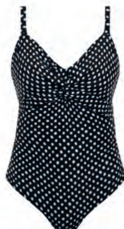
FS6728 UW TWIST FRONT SUIT - LIGHT CONTROL

UK 32-40 D-GG 34-38 H EU 70-90 D-J 75-85 K