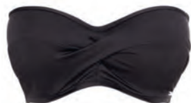
FS5750 UW TWIST BANDEAU BIKINI TOP

UK 30-40 D-GG 30-38 H EU 65-90 D-J 65-85 K