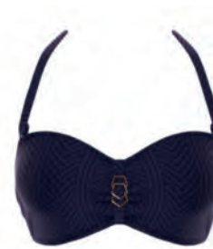
FS6902 UW BANDEAU BIKINI TOP

UK 32-40 D-G 32-38 GG 32-36 H EU 70-90 D-I 70-85 J 70-80 K