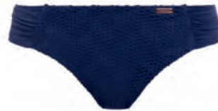
FS6685 MID RISE BRIEF