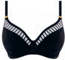
FS6509 UW GATHERED FULL CUP BIKINI TOP