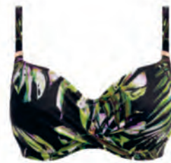
Palm Valley - Black