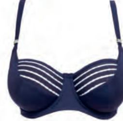
FS6502 UW BALCONY BIKINI TOP

UK 30-40 D-F 30-38 FF 30-36 G EU 65-90 D-G 65-85 H 65-80 I