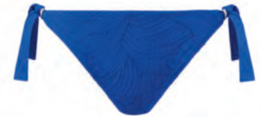
FS6357 CLASSIC TIE SIDE BRIEF

UK 32-40 D-GG 32-38 H EU 70-90 D-J 70-85 K