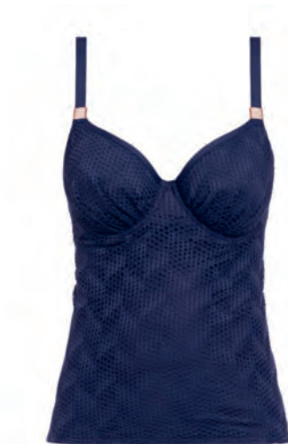
FS6684 UW GATHERED FULL CUP TANKINI

UK 32-40 D-G 32-38 GG-H EU 70-90 D-I 70-85 J-K