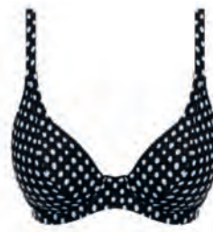
FS6722 UW PLUNGE BIKINI TOP