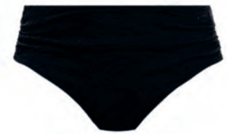
FS6363 DEEP GATHERED BRIEF