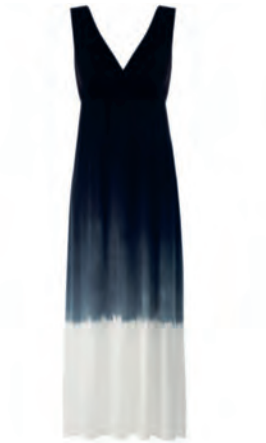
Aurora - Monochrome