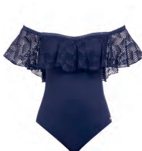
FS6688 UW BARDOT SUIT

UK 32-40 D-G 32-38 GG-H EU 70-90 D-I 70-85 J-K