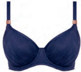
FS6680 UW GATHERED FULL CUP BIKINI TOP

UK 30-40 D-GG 32-38 H EU 65-90 D-J 70-85 K