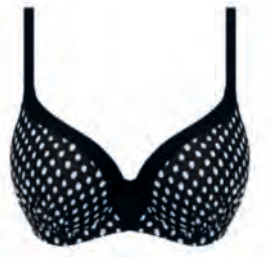
FS6721 UW MOULDED BIKINI TOP