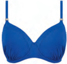
FS6355 UW MOULDED GATHERED BIKINI TOP